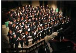
The Angel City Chorale.